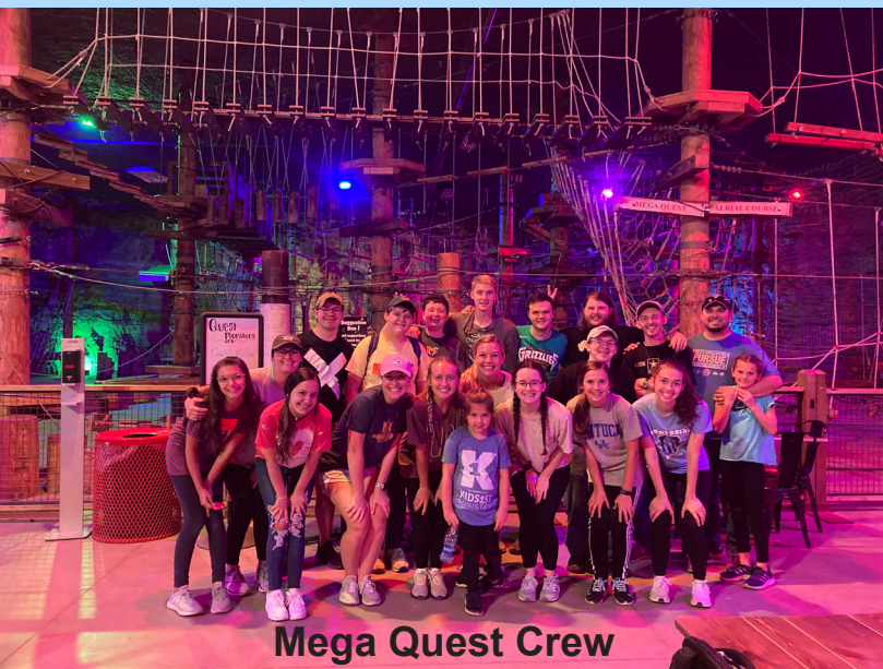
Mega Quest Crew